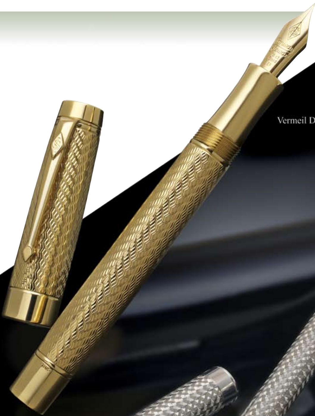
Vermeil Drake Limited Edition $1,650