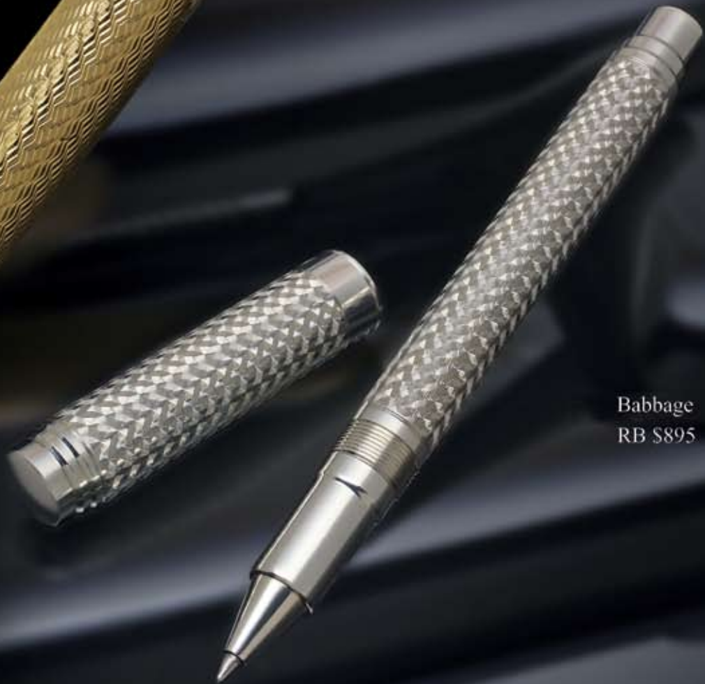
Babbage RB $895